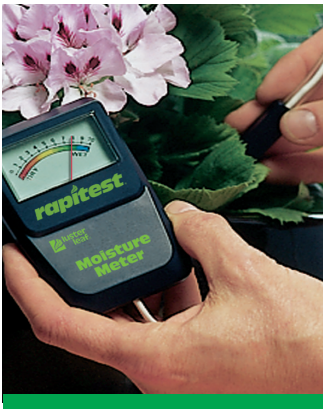
Designed for Accuracy